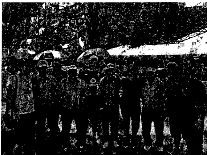
Errebal with members of the Reno ZBBC at the 50 th Annual Festival